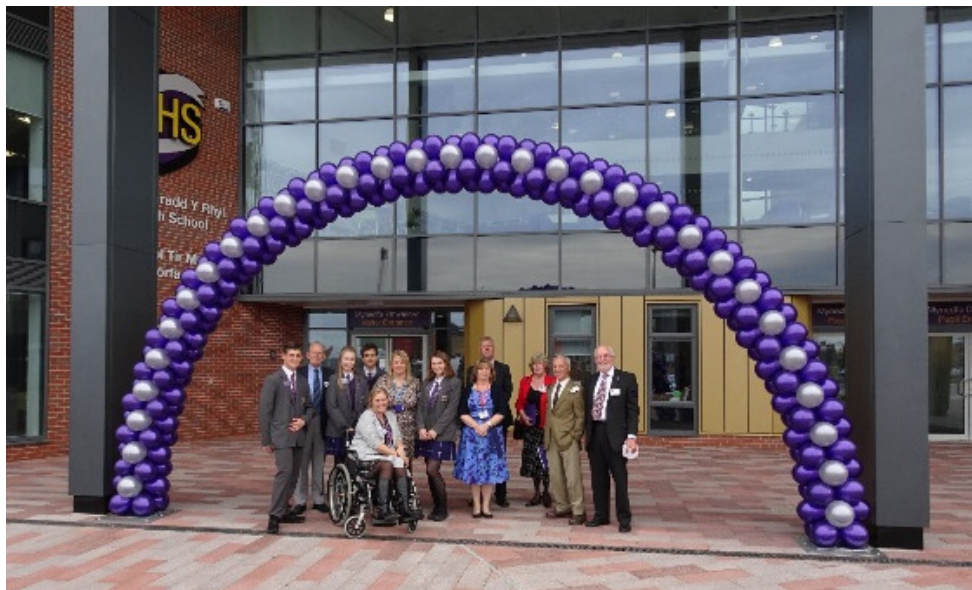
Headteachers and Deputy Heads of Rhyll High School and Ysgol Tir Morfa with the Head girls and boys and the RGS representatives celebrating the school opening

Overall the word "impressive" seems to me to understate what has been achieved at the school. It is so good to see that it will be a centre of excellence for the community, to raise local aspiration and encourage the development of the potential of all that attend.